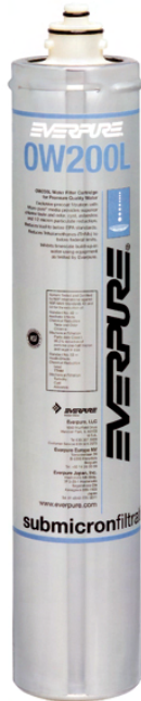
OW200L Replacement Cartridge: EV9619-01

Delivers premium quality drinking water for bottleless coolers and drinking fountains