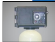
Inset: 2510 Valve with Mechanical Timer and Enviro Cover shown