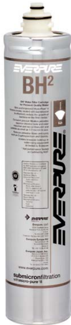
BH 2 Replacement Cartridge: EV9612-50

Delivers premium quality water for coffee applications