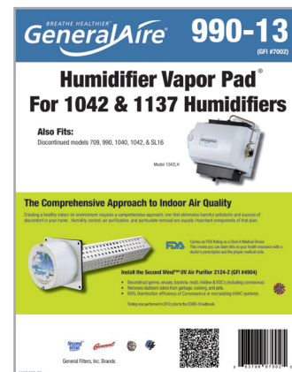
990-13 Vapor Pad® (GFI #7002)