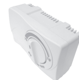
MXH3C Manual Humidistat GFI #7038 Included