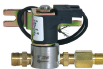
990-53 Solenoid Valve GFI #7014