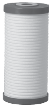
AP810 / AP811