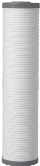
AP810-2 / AP811-2