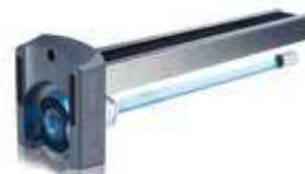
UV Air Purification and Odor Absorption