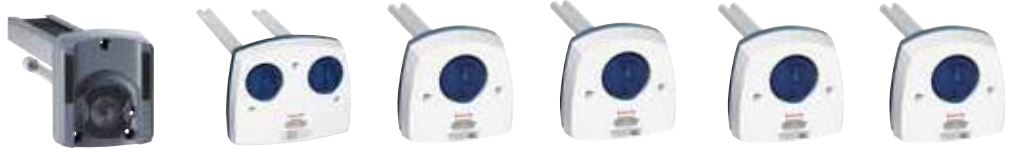
Model UV2400U5000 UV100E2009 UV100E3007 UV100E1043 UV100A1059 UV100A2008