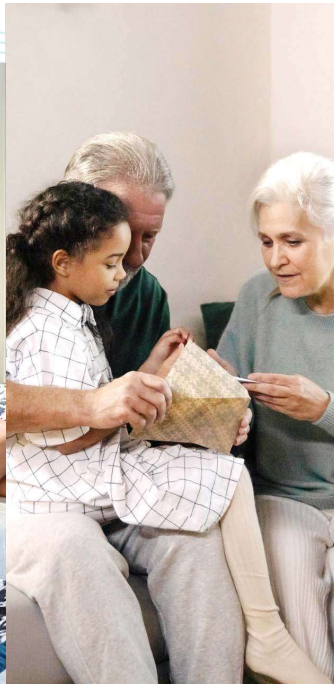
Senior Living Communities